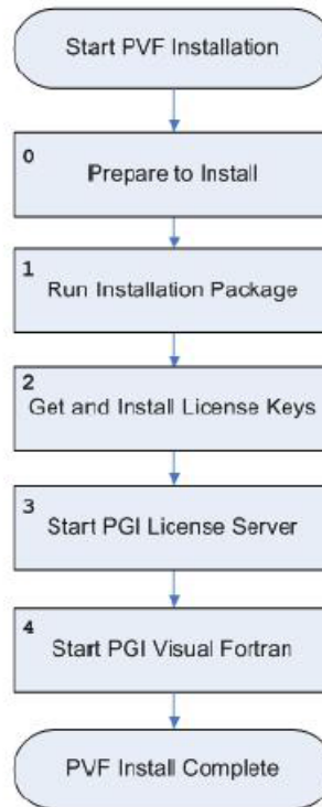
Figure 1 PVF Installation Overview

For more complete information on these steps and the specific actions to take for your operating system, refer to the remainder of this document.